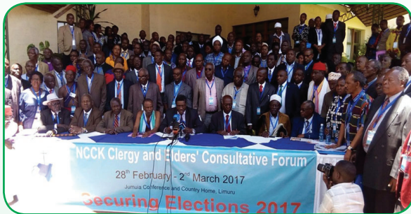
Wanainchi participate in decision making forums