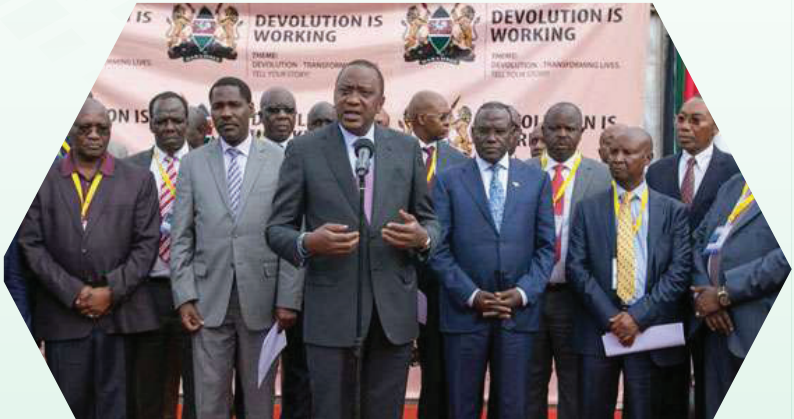
His Excellency President Uhuru Kenyatta with the Council of Governors in a past conference