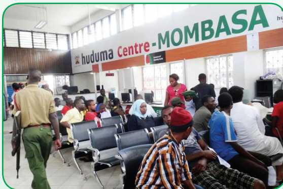
Mombasa residents wait to be served at the Huduma Centre