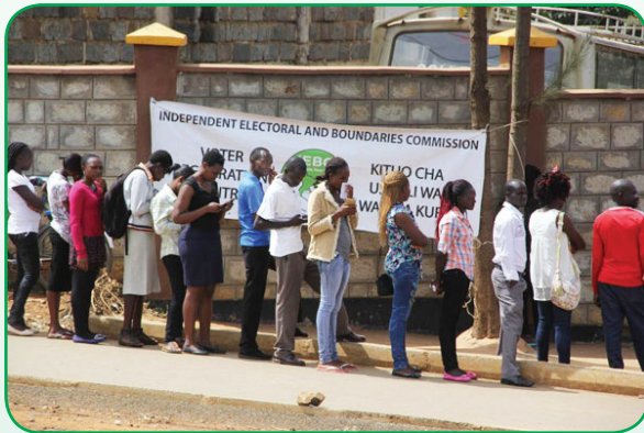
Citizens queuing to vote for leaders of their choice