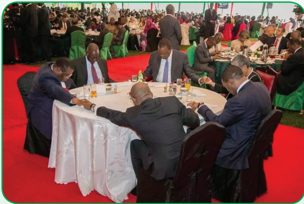
A section of leaders during the National Prayer breakfast