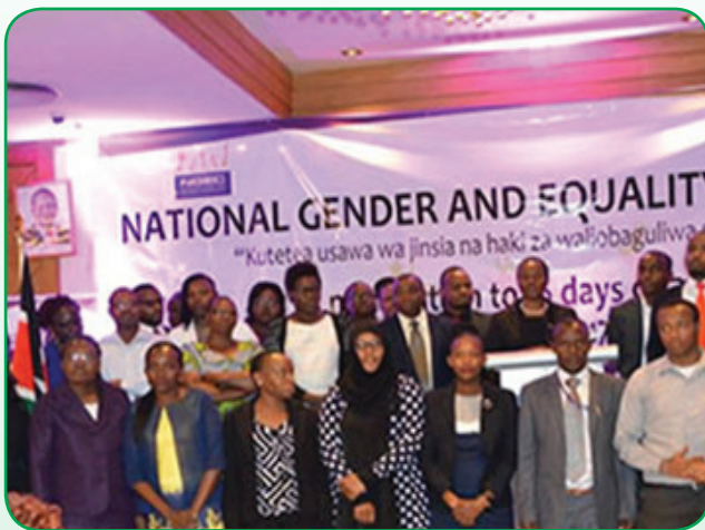
Participants at the National Gender and Equality forum