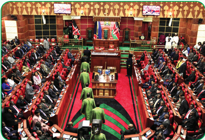
Parliament in session