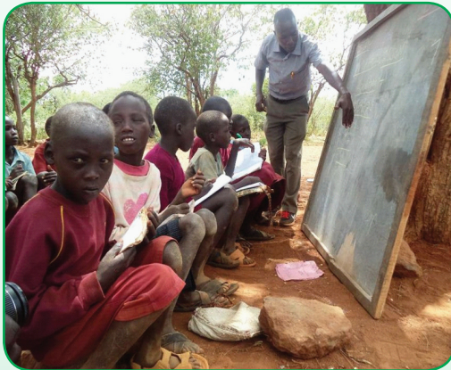
Pupils learning under a tree