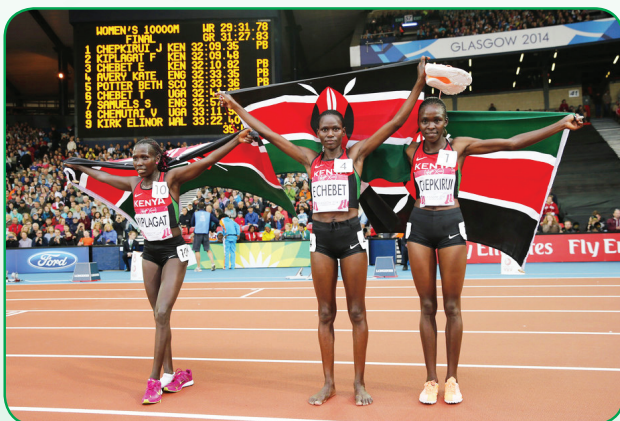
Kenyan athletes: The pride of the country over the years