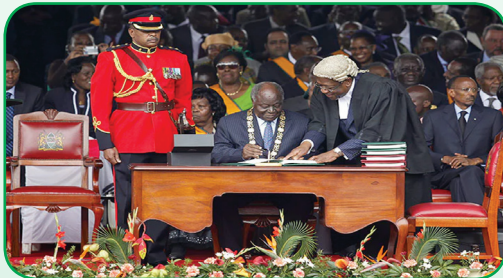
President Mwai Kibaki signs the new Constitution of Kenya into law on Friday 27 th August 2010 at Uhuru Park

These are normative standards that oblige the State to perform its functions in a manner that promotes the general well-being of the people.