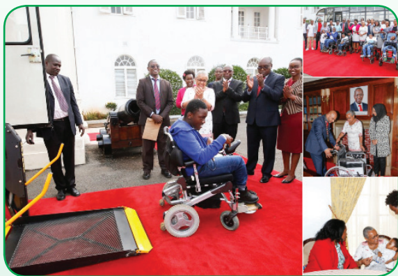
Beyond Zero Mobile Clinic

as spelt out in the Constitution and the Bill of Rights regardless of one's status ( Article 28 ).